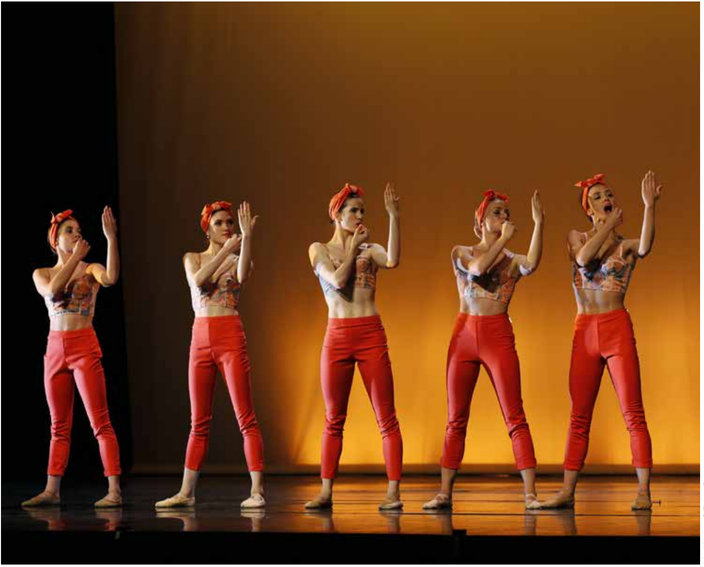
Mad Women © Thierry Fonteyne