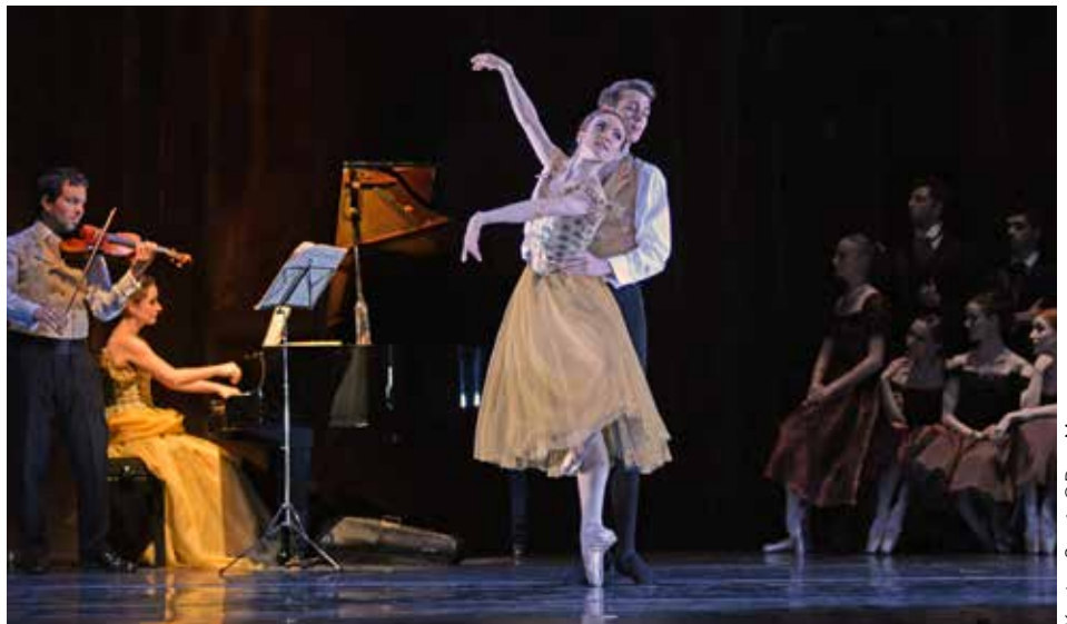
Kreutzer Sonata

Later on, Pozdnyshv discovers the violinist visiting his wife, a scene that triggers his jealous rage to a tragic, violent conclusion.