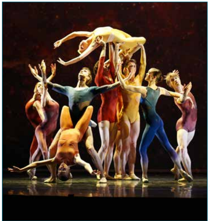
Orbital Motion © Thierry Fonteyne