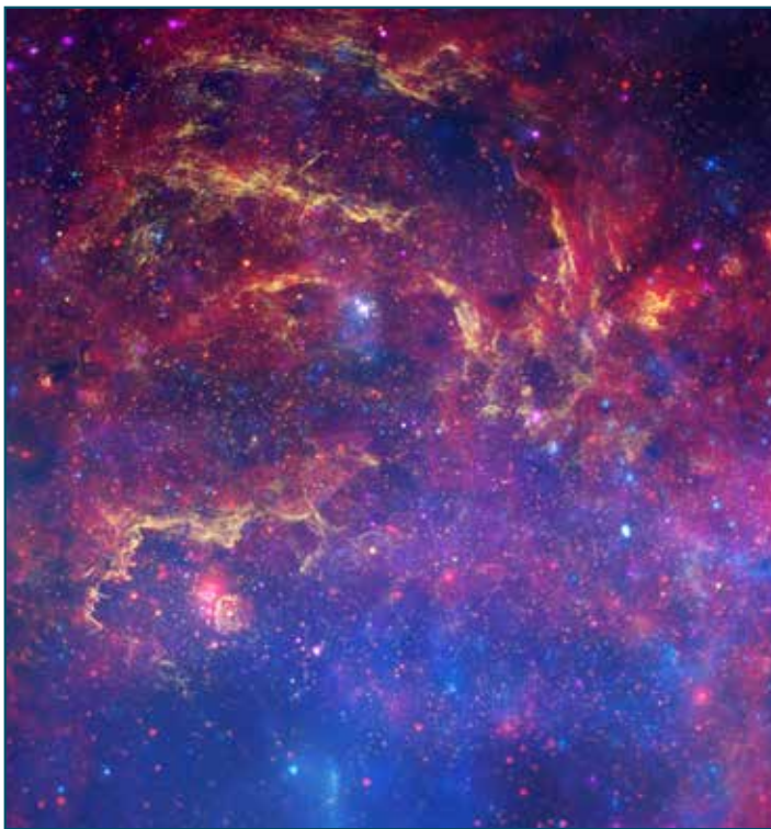
Hubble Space Telescope image of nebulae