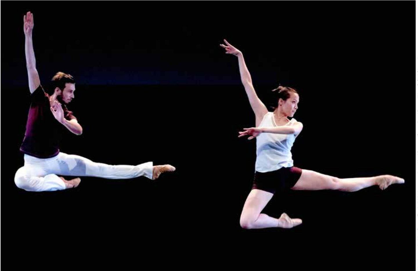
Wundarra at Ignition Dance Festival 2015; co-produced by Kingston Council and Dance West