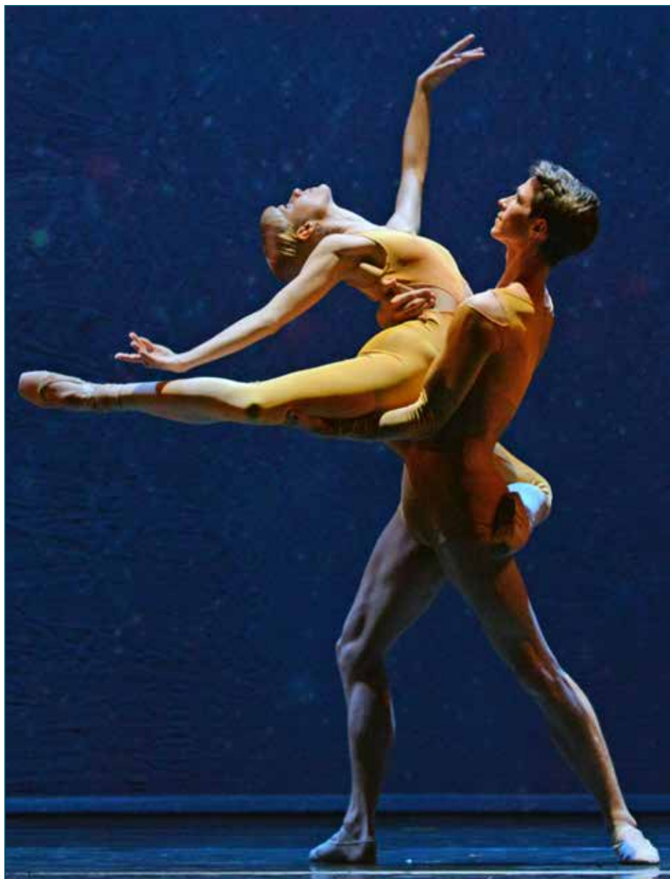
Orbital Motion © Dave Morgan