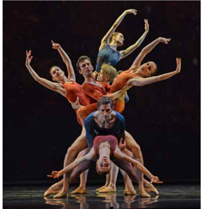
Orbital Motion © Dave Morgan

Let us know what you thought of the show by following us on Twitter @NEBT_tweets and using #NEBTSummer