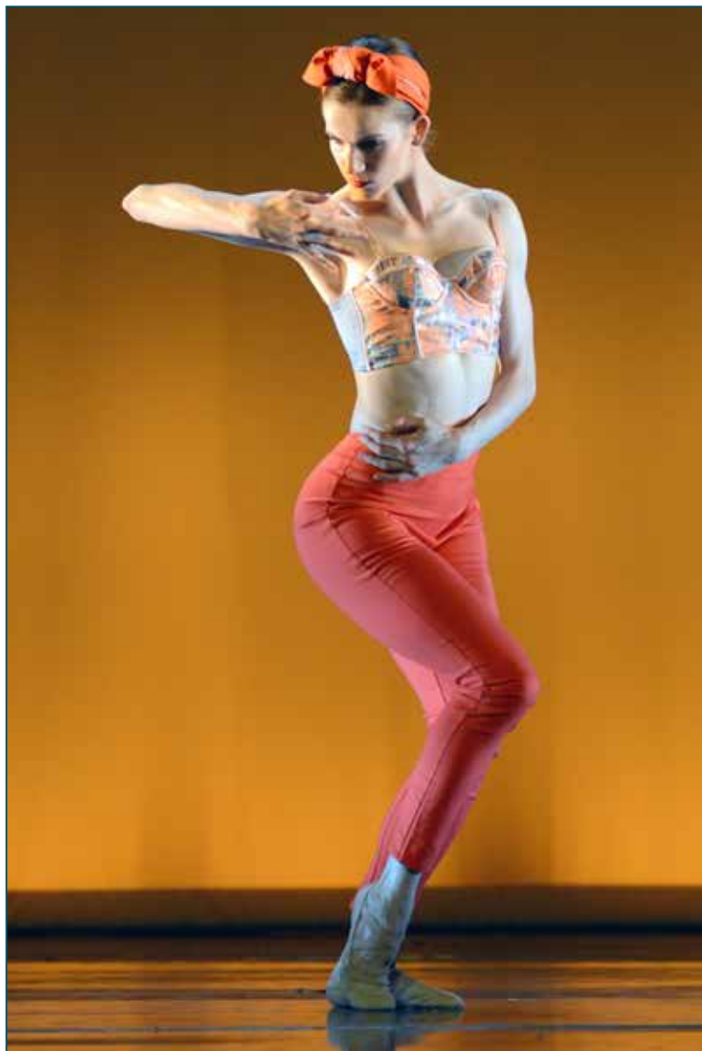
Mad Women