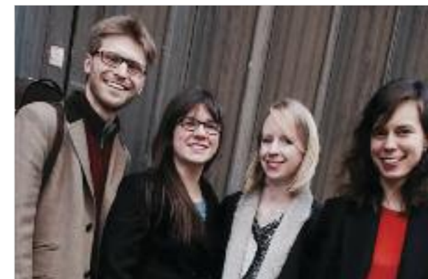
GILDAS QUARTET Strings